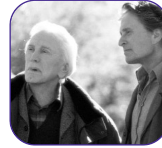
(Top L-R) THE PRIME OF MISS JEAN BRODIE; TAXI DRIVER; Queer; Shorts: "You 2" (Bottom) EDGE OF DOOM; LAST DANCE; IT RUNS IN THE FAMILY