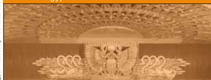
Egyptian Theatre Ceiling.

All films at the Egyptian are in the 616-seat Lloyd E. Rigler Theatre unless it is specified that the film is in the 78-seat Steven Spielberg Theatre. The Egyptian Theatre is at 6712 Hollywood Boulevard, LA, CA 90028 (between McCadden Place & Las Palmas Avenue) in Hollywood.