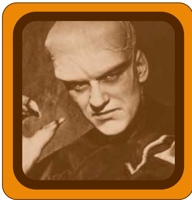
Left: Angry Young Cinema: The Original British New Wave: Julie Christie in DARLING (right) Alan Rickman Series: THE THING FROM ANOTHER WORLD