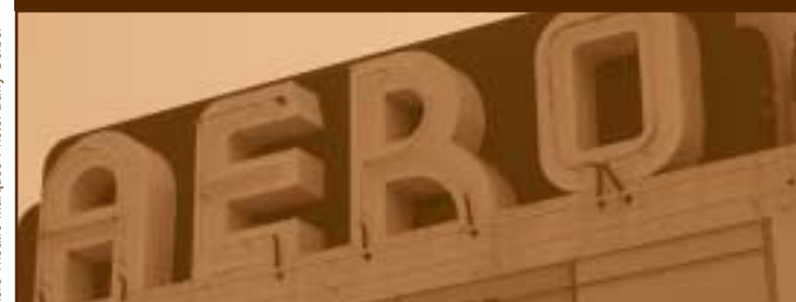
Aero Theatre Marquee

All films scheduled for the Aero are OPEN TO THE PUBLIC and are held in the 425-seat Max Palevsky Theatre at 1328 Montana Avenue, Santa Monica, CA, 90403 (at 14th Street).